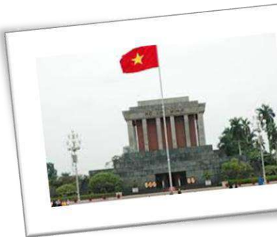
Ho Chi Minh's Mausoleum