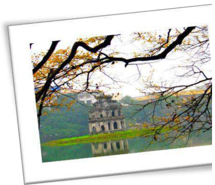
Hoan Kiem Lake

Upon on your flight at Noi Bai airport, tour guide and driver will pick you up and transfer to visit the Ho Chi Minh Complex , which includes Ho Chi Minh's Mausoleum - the final resting place of the beloved national hero, Uncle Ho - and President Ho Chi Minh's stilt house where he lived off and on from 1958 to 1969. Enjoy the architectural and historical aspects of Uncle Ho's final resting-palace lying to one side of the Mausoleum is the One Pillar Pagoda , built by King Ly Thai To in 1049 the structure has become an important symbol for the people of Hanoi. After that, we will continue to visit the Literature Temple and Quoc Tu Giam - Vietnam's first University, constructed in 1070. Its gardens and well-preserved architecture offer a relaxing glimpse into Vietnam's past. Then we will stop at Hoan Kiem Lake (Sword Lake) and learn more about the lake's legend, visiting outside of Ngoc Son Temple and Hanoi Old Quarter .